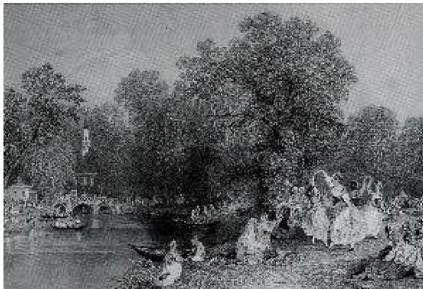
Figure 10. People having fun in Kağıthane Promenade in an engraving by Thomas Allom, R. Walsh, Constantinople and the Scenery of the Seven Churches of Asia Minor , 1838.