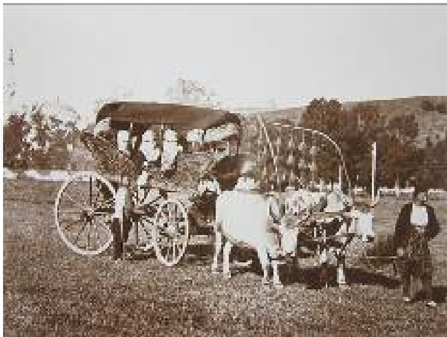
Figure 2. An ox-cart going to the promenade area, in a photograph by B. Kargopoulo, 1854.

The Sa'dabad Summer Palace, with its marble floors, built on top of 30 columns next to the river, had an important place and left important traces in the Ottoman history, culture, arts and literature. Kağıthane Promenade kept its importance by being an actively used area until the beginning of the 20 th century. The area which was for a period used as a military zone, now is filled with residential buildings. Today, apart from plane and ash trees, two types of trees which are not found in elsewhere in Istanbul: first is American swamp cypress ( Taxodium distichum ) and the second is Zelkova ( Zelkova carpinifolia ), a type of elm tree originating in North Persia. Four of the American cypress trees (trunk peripheries: 290, 285, 268 and 265 cm's.) and two of the Zelkovas (trunk peripheries: 285 and 277 cm's.) are in considerably good health and are estimated to be 200-250 years old [4]. Those trees are presumed to be the ones which could reach our day and age, among the hundreds of exotic trees brought from European plantations for this promenade area.