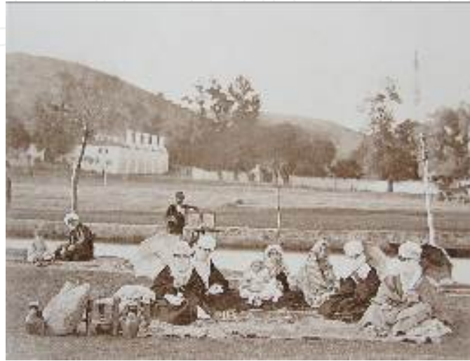
Figure 8. Women having a picnic in the promenade, 1854.

Göksu Promenade started to fall into decay as from the end of the times of Abdulhamid II. and lost its vivacity with the announcement of the second constitutionalism. Today the meadow between the two rivers is filled with buildings, however the topography can still be perceived.