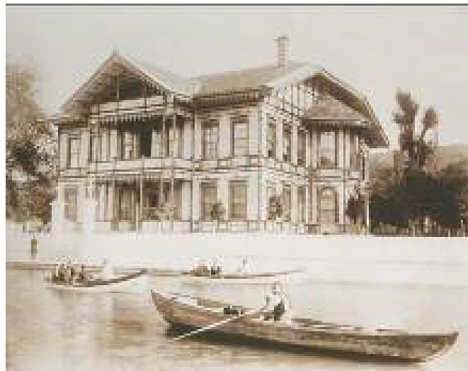
Figure 4. İmrahor (Mirahur) Mansion in Kağıthane Promenade area and the touring rowboats