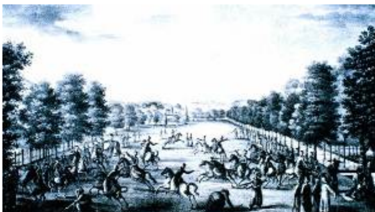
Figure 9. Sultan Selim III. Period “Cirit Field”, in an engraving by Melling.

short lance, made of hard wood, with an iron head. The game is a centuries-old one, played on horses in two teams. It is a field and war game, which was played in many open areas in the empire. To attract the public attention, drums and shawms were played.