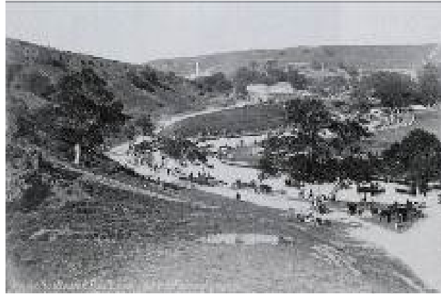
Figure 3. Kağıthane Festivals in the beginning of the 20 th century.