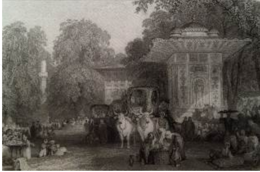
Figure 11. People having fun in Kağıthane Promenade in an engraving by Barlett.