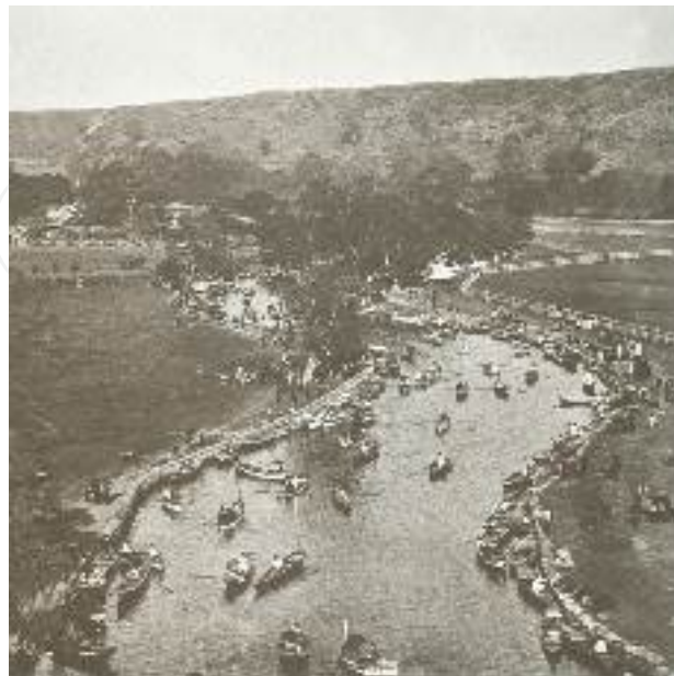
Figure 5. Rowboats on the Kağıthane river, 19 th century.