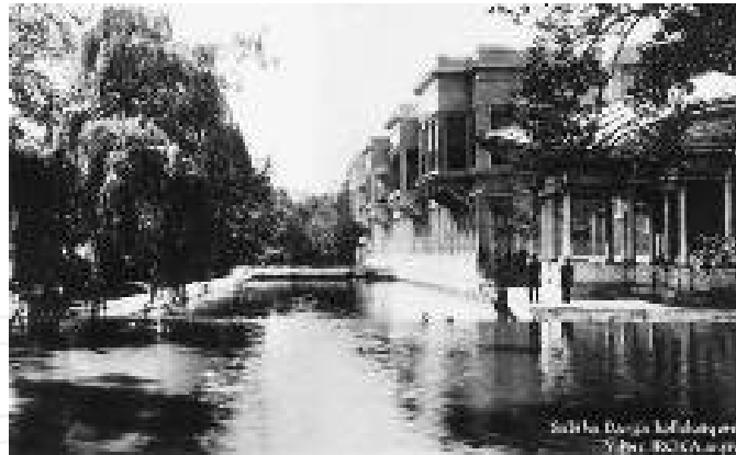
Figure 6. Çaglayan Summer Palace built next to the water canal by Sultan Abdulaziz in 1862. (Çaglayan Summer Palace was built in the place of previous sultan mansions. Its architects are Agop and Sarkis Balyan. The water of the river was taken in a canal, directed in front of the palace and it enabled an unlike landscape design)