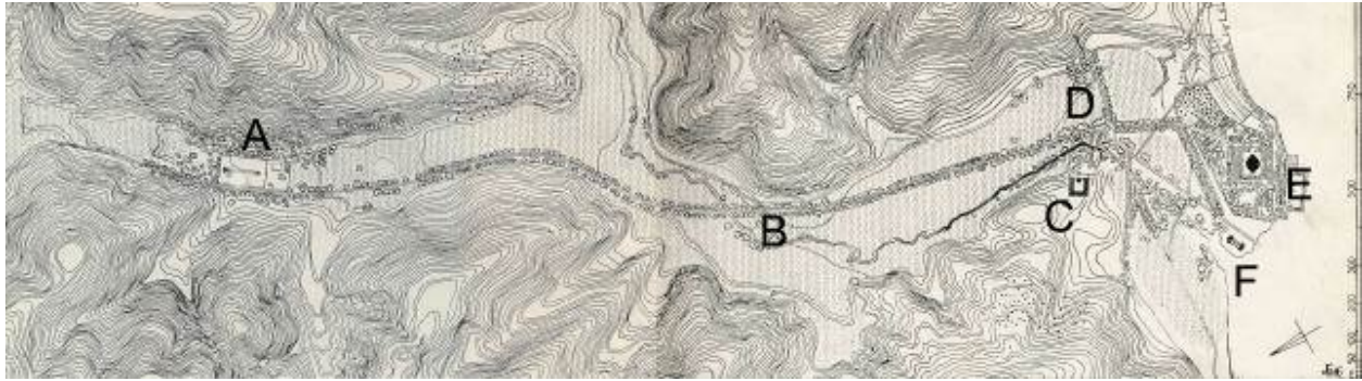
Figure 7. Beykoz Meadow, S. H. Eldem, A: Summer house and its garden, B: Fountain, C: Barracks, D: Namazgah , E: Seaport and summer house, F: Stable

the meadow had been used for military purposes, such as the accumulation of the soldiers and camping.