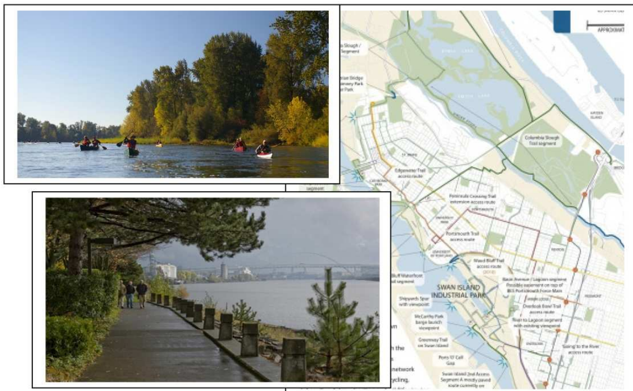
Figure 3. Willamette River Greenway, Oregon

Recreational greenways: They are the spaces that have characteristics of routes and pathways of various type and go along a very long line (Little, 1995). Beside the natural corridors, canals and railway routes can be examples of that kind of spaces. These ways are formed along the routes and pathways passing through recreational spaces generally linked water and landscape resources which are of high visual value (Fabos, 1995). The recreational focuses in these pathways not only can be both urban and rural but local, regional, national and international ( Fig. 3 ).