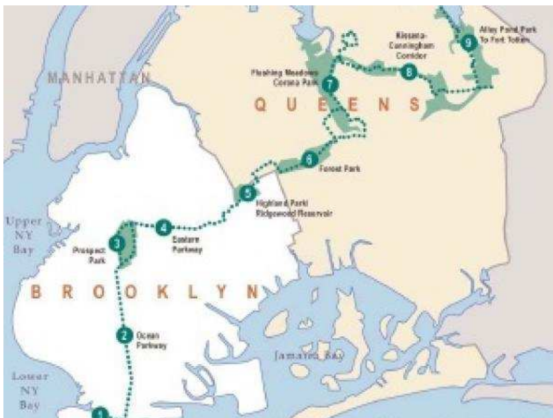
Figure 6. The Brooklyn - Queens Greenway

The aim of Brooklyn–Queens greenway planning is that ecological, cultural, recreational sources can be easily reachable and make possible various uses of it for city people ( Fig. 6 ). Especially, wide open spaces are present for those who prefer a lot of soccer and baseball, tennis courts that are more than 100, uses that make possible various water activities along the greenway that have much rich potential in terms of recreational uses, two golf areas, two ice skate courts, funfair and passive recreations (Little, 1995).