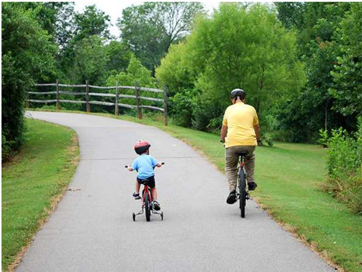
Figure 1. Salisbury Greenway Bicycle Way/ North Carolina

The first serious attempt in Europe is made, in 1997, by establishing European Greenway Association (EGWA). This Association define the greenways as both protecting environmental values and the network of routes that are allocated for only the motorless vehicles (on horseback, bicycling or etc.) in order to increase the health of environmental life, considering integrated management approach (Fig. 1) (European Greenways Association, 2004).