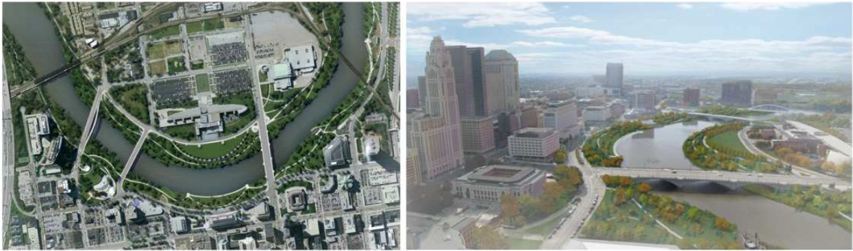
Figure 2. Scioto River Greenway

water resources such as, flood beds, river corridors and wetlands. The aim of creating these greenways is to protect resources, ameliorate and manage (Ahern, 1995).