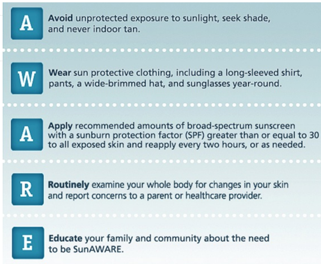
Figure 3. Sun protection advice displayed on SunAWARE website using the acronym AWARE. http://www.sunaware.org/be-sunaware/

awareness is encouraged by campaigns such as national “Don’t Fry Day” that takes place on the Friday before Memorial Day in the U.S. and is supported by the National Council on Skin Cancer and SunWise program [5, 51].