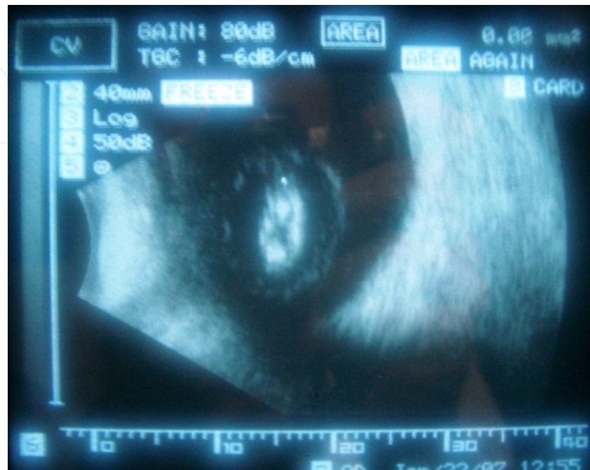
Fig. 1. Dropped nucleus

can happen in even experienced hands, and can be a worry as corrective action requires intervention in the posterior segment (Lu et al., 1999). Removing a dropped nucleus or even nuclear fragments is essential as it can either lead to long-standing uveitis, vitritis, cystoid macular oedema, and secondary glaucoma (Kaputsa et al., 1996; Lu et al., 1999).