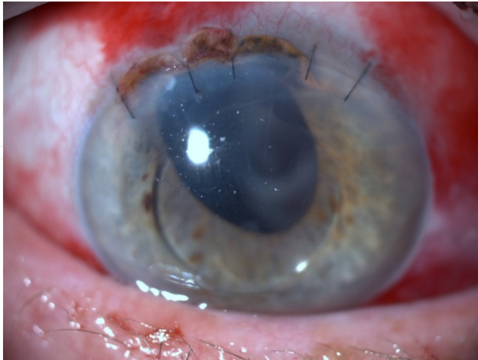
Fig. 2. Iris Prolapse