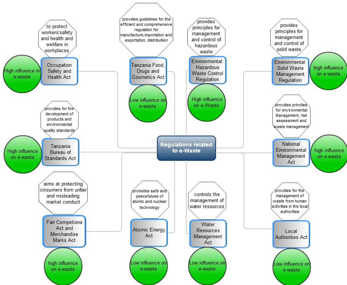
Figure 2. A summary of regulation related to e-waste management, their objectives and impact on e-waste management

Figure 1 shows a brief overview of different policies related to waste management. The figure summarizes the objectives and the relevancy of each particular policy as it relates to e-waste management. In the figure, the hexagon represents the objectives that a particular policy intends to fulfil, while the circle represents the relevancy of the policy to e-waste and the policy is represented by the smooth rounded rectangle.