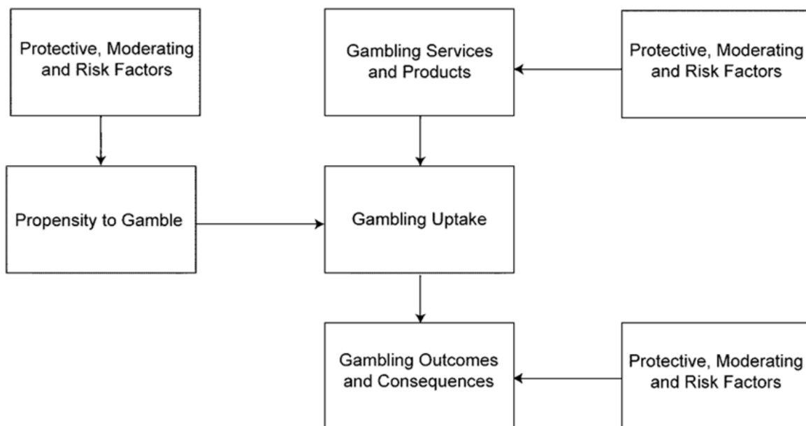
Fig. 1. Model of influences on gambling behaviours and outcomes (Thomas & Jackson, 2004:44)

The Model of Influences on Gambling Behaviours and Outcomes has been developed specifically to examine influences on the behaviour of gamblers and the consequences of their gambling activities (Thomas & Jackson, 2004). Three important elements of gambling uptake are integral to this model. These elements are the propensity to gamble, the influence of gambling products and services on gambling behaviour and the consequences of gambling behaviour. Each of these three elements has accompanying risk, moderating and protective factors. Leaving aside moderating factors, risk and protective factors may vary according to the propensity to gamble by different populations and by the nature and availability of different forms of gambling. Risk and protective factors associated with gambling outcomes may encourage further gambling for some gamblers but not for others. Thus, designing appropriate public health strategies to address problematic gambling requires a sound understanding of the risk and protective factors associated with gambling by the targeted population. For a depiction of this model, see Figure 1.