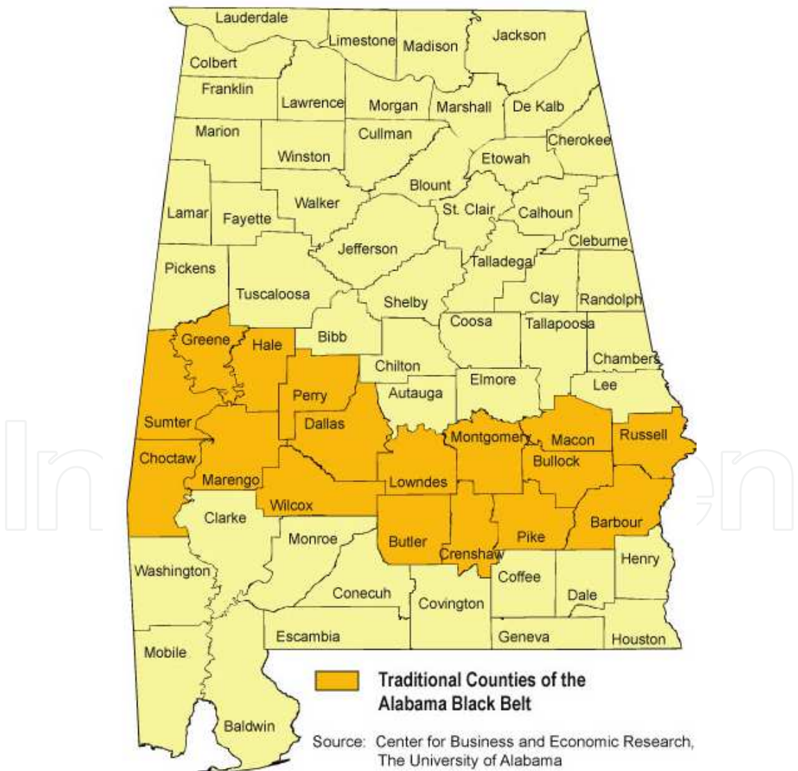
Fig. 2. Alabama black belt counties.

population resides in this region compared to 17.5%, 18.8%, 8.7% in the northeast, Midwest, and West, respectively (US Census Bureau 2000). For example, in the state of Alabama there are 17 Black Belt counties which include Barbour, Bullock, Butler, Choctaw, Dallas, Greene, Hale, Lowndes, Macon, Marengo, Montgomery, Perry, Pike, Russell, Sumter, and Wilcox (Figure 1). The total population in this region is close to 600,000 or about 13 percent of the 4.5 million in the State. The percent of poverty ranges from 26.8% to 40% within the Black belt counties (Federal Statistics, 2004). The per capita income for the State of Alabama is estimated at $33,945, but is much lower in selected Black Belt counties with median incomes ranging from $24,969 to $30,370. Furthermore, median incomes for non-Black Belt counties in Alabama ranged from $41,770 to $64,371. When compared with other Alabama counties, Black Belt counties in Alabama have disproportionate greater rates of heart disease, cancer, hypertension and diabetes. CVD mortality rates are higher in Black Belt counties compared to non-Black Belt counties in Alabama (Table 1). Similar trends exist in the Delta region. In general CVD mortality rates are higher, the rate in Alabama is 235, Mississippi is 267.6 and South Carolina is 306 (from 2004 report) compared to the national average of 190 per 100,000.