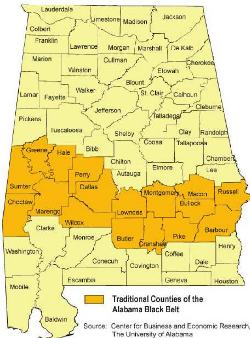
Fig. 2. Alabama black belt counties.

population resides in this region compared to 17.5%, 18.8%, 8.7% in the northeast, Midwest, and West, respectively (US Census Bureau 2000). For example, in the state of Alabama there are 17 Black Belt counties which include Barbour, Bullock, Butler, Choctaw, Dallas, Greene, Hale, Lowndes, Macon, Marengo, Montgomery, Perry, Pike, Russell, Sumter, and Wilcox (Figure 1). The total population in this region is close to 600,000 or about 13 percent of the 4.5 million in the State. The percent of poverty ranges from 26.8% to 40% within the Black belt counties (Federal Statistics, 2004). The per capita income for the State of Alabama is estimated at $33,945, but is much lower in selected Black Belt counties with median incomes ranging from $24,969 to $30,370. Furthermore, median incomes for non-Black Belt counties in Alabama ranged from $41,770 to $64,371. When compared with other Alabama counties, Black Belt counties in Alabama have disproportionate greater rates of heart disease, cancer, hypertension and diabetes. CVD mortality rates are higher in Black Belt counties compared to non-Black Belt counties in Alabama (Table 1). Similar trends exist in the Delta region. In general CVD mortality rates are higher, the rate in Alabama is 235, Mississippi is 267.6 and South Carolina is 306 (from 2004 report) compared to the national average of 190 per 100,000.