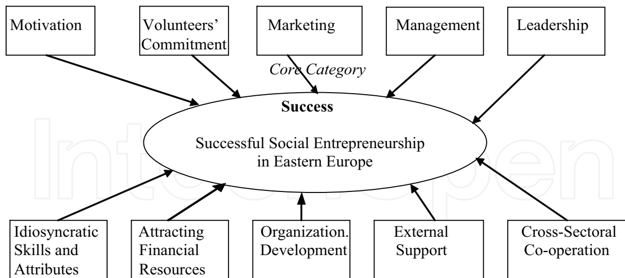
Fig. 1. Successful Social Entrepreneurship in Eastern Europe