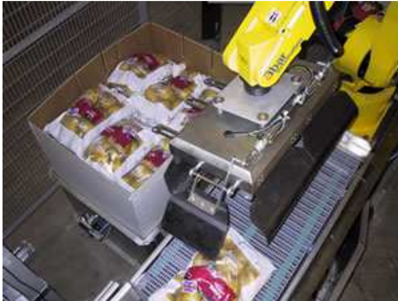
Fig. 1. Pack rotation carry out by an ultra reliable.

The robot is often guided by a vision system (Piasek, 2010). Pick and place robot cells (Fig. 1) are available for pre-packed bags or trays containing fresh or processed vegetables, salads or mushrooms ranging in weights from a few grams to 50 kg, and are capable of loading plastic crates and roll containers (Abar automation, 2011 & Robots & Robot Controllers Portal, 2010).