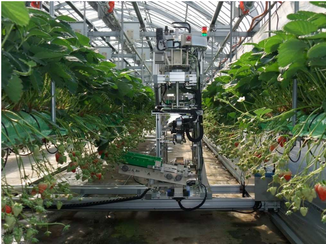
Fig. 3. A harvesting robot of strawberry (Courtesy: BRAIN, Shigehiko Hayashi, 2011).