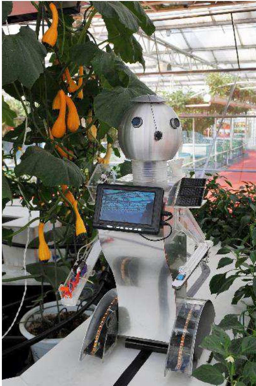
Fig. 2. A robot for vegetable planting

humidity, light, detect disease of the vegetables and pick up the ripe ones through identifying the colour.