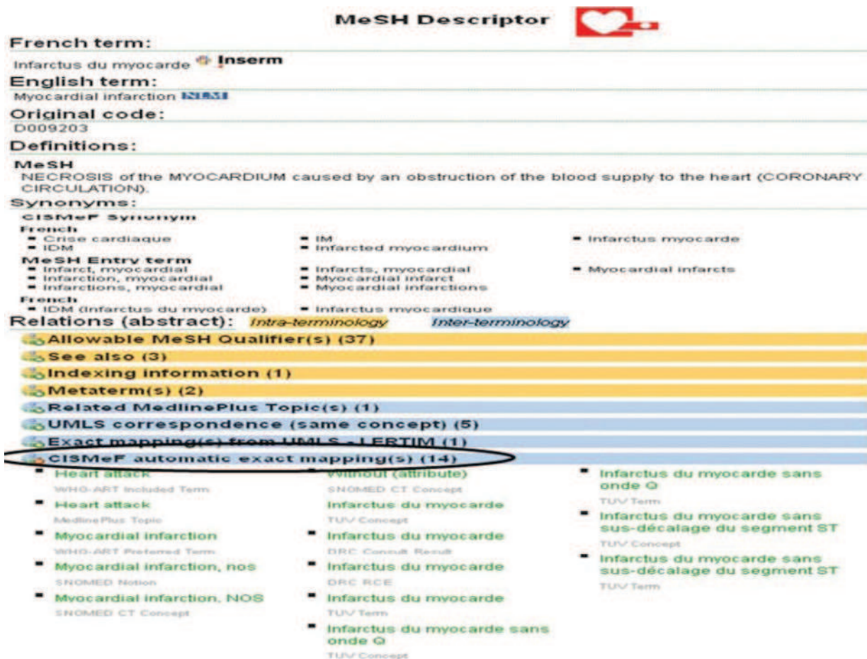
Fig. 2. Mapping of the MeSH term “myocardial infarction” according to the lexical approach in HMTP (Exact correspondence).