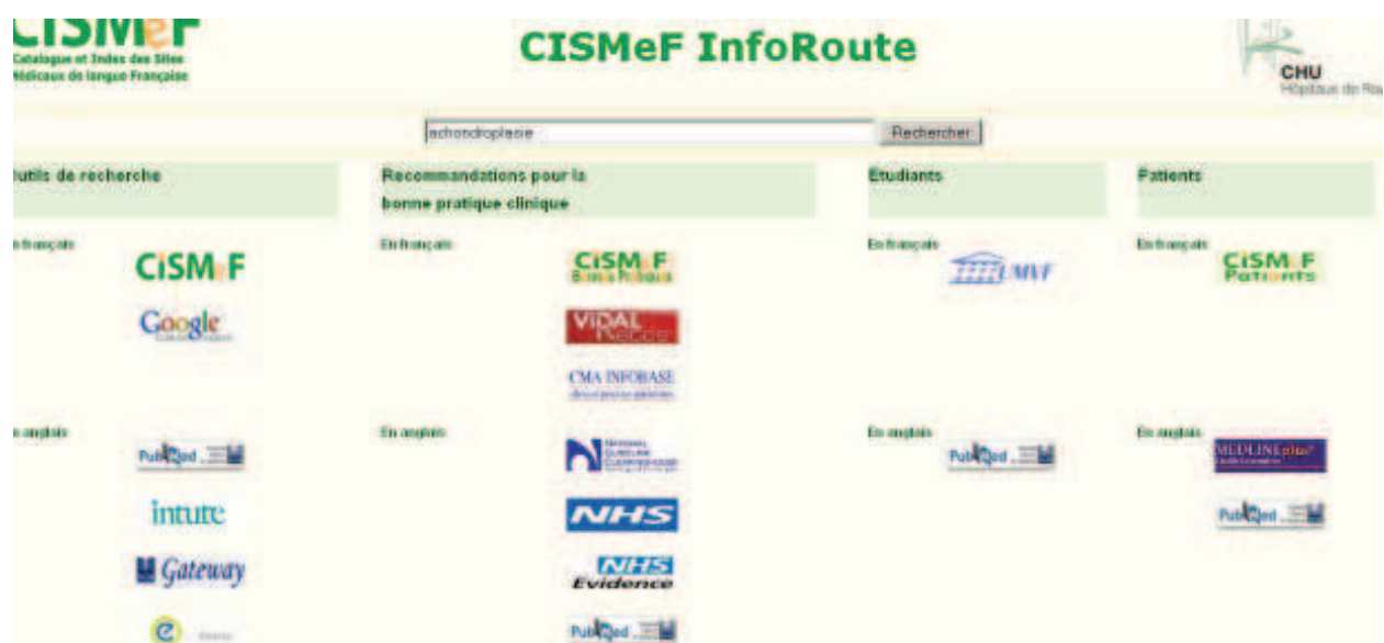
Fig. 3. CISMeF InfoRoute.