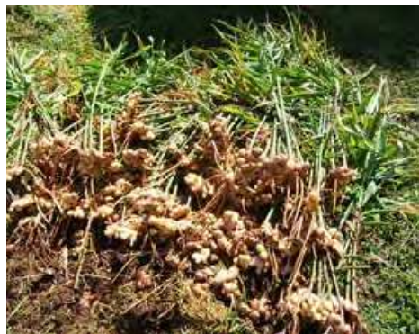
Fig. 2. Ginger harvest

The ginger rhizome has a pungent aroma, smelling fresh and sweet, and tastes hot, with a sharp and awakening effect. The rhizomes are harvested, when the leaves start to dry and contract in the winter period as shown in Fig 2. It is the rhizome that concentrates ginger's nourishing, healing and reproductive qualities. Ginger is propagated in spring from stored rhizome stock of the previous year.