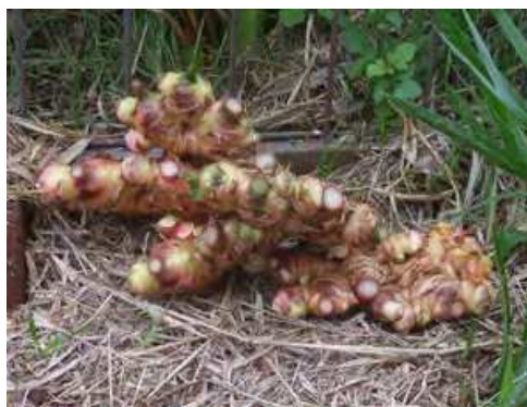
Fig. 1. Fresh rhizome

The ginger rhizome is a spreading bulbous, stem that develops horizontally close to the soil surface. It forms regularly spaced buds that grow to either shoots or new rhizomes. The rounded fresh buds are about the size of a knuckle, and coloured soft lemon-green, with a fleck of pink. A freshly prepared rhizome reflects these colours in Fig 1.