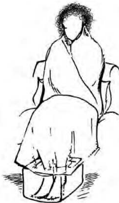
Fig. 7. Ginger footbath

The method involves filling a deep basin with warm water and adding 10g of ground dry ginger. The ginger is mixed into the water for about 30 seconds. The recipient sits in a relaxed position for the footbath, encompassed in a warm soft blanket/sheet that is large enough to wrap around the shoulders and reach to the floor. The feet are placed in the footbath 10 minutes, as long as the footbath is experienced as warm and comfortable then dried well and warm socks put on. The recipient can rest a further 15 minutes if required.