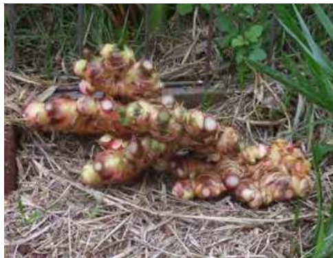
Fig. 1. Fresh rhizome

The ginger rhizome is a spreading bulbous, stem that develops horizontally close to the soil surface. It forms regularly spaced buds that grow to either shoots or new rhizomes. The rounded fresh buds are about the size of a knuckle, and coloured soft lemon-green, with a fleck of pink. A freshly prepared rhizome reflects these colours in Fig 1.