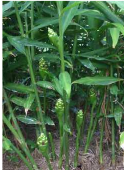
Fig. 4. Ginger flower cones

Ginger has specific features that relate to its selection in the therapeutic treatment of osteoarthritis. The ginger plant is robust, upright and balanced, with strong life giving forces of warmth and energy focused in the swollen stem base or rhizome. Ginger is a unique plant that stores all its reproductive, nourishing and medicinal forces in a rhizome, with the flowers and seeds being inconspicuous and often absent. Both Eastern and Western alternative medical approaches utilise the heat and vitality of the ginger rhizome in managing osteoarthritis symptoms.