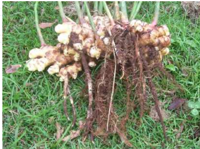
Fig. 3. Ginger roots

Long tap roots grow from the seams of the lower buds and anchor the plant deep in the earth. These tap roots reach to about 80cm and are milky-white, strong and juicy; tasting rather like ginger radishes. The tap roots have few hairs and no lateral shoots. Thin, short fibrous roots also grow from the seams of the fresh buds and these are coated in loose soil and minute micro-organisms.