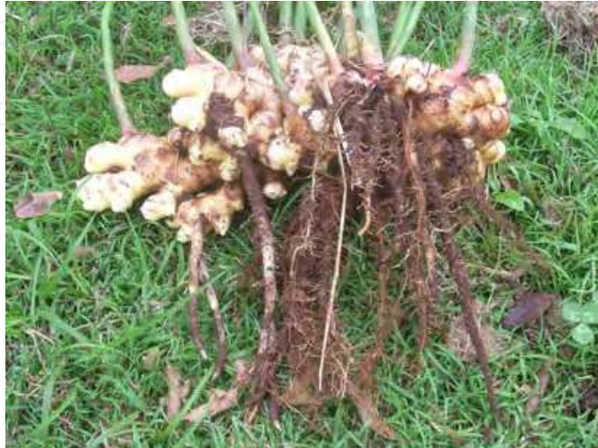
Fig. 3. Ginger roots

Long tap roots grow from the seams of the lower buds and anchor the plant deep in the earth. These tap roots reach to about 80cm and are milky-white, strong and juicy; tasting rather like ginger radishes. The tap roots have few hairs and no lateral shoots. Thin, short fibrous roots also grow from the seams of the fresh buds and these are coated in loose soil and minute micro-organisms.