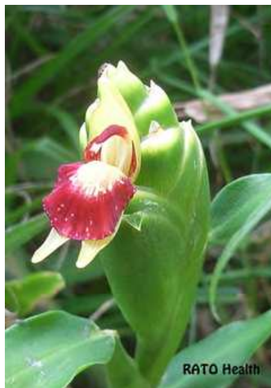
Fig. 5. Ginger flower

Ginger has specific features that relate to its selection in the therapeutic treatment of osteoarthritis. The ginger plant is robust, upright and balanced, with strong life giving forces of warmth and energy focused in the swollen stem base or rhizome. Ginger is a unique plant that stores all its reproductive, nourishing and medicinal forces in a rhizome, with the flowers and seeds being inconspicuous and often absent. Both Eastern and Western alternative medical approaches utilise the heat and vitality of the ginger rhizome in managing osteoarthritis symptoms.