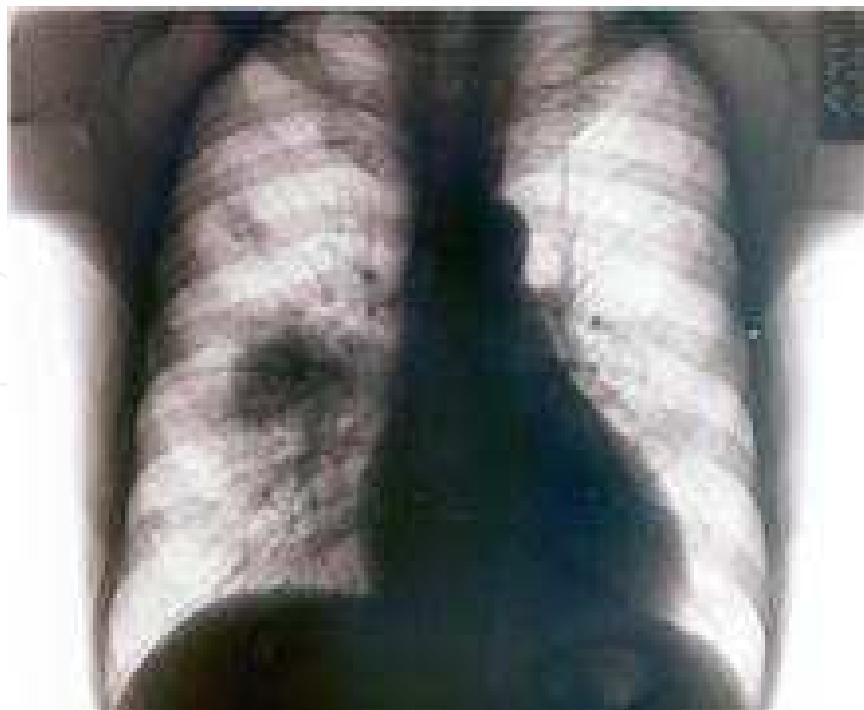
Fig. 1. Radiographic changes associated with Nocardia infection.

Time of onset of infection after transplantation is variable, but tends to be late. It rarely occurs in the first month and may range from 1 to 28 years (Santos et al., 2011). The greatest risk is within the first year (Peleg et al., 2007a, Clark, 2009), but later cases have also been described (Peraira et al., 2003, Oszoyoglu et al., 2007). Pulmonary presentation is the most common, with subacute and insidious pneumonia. Less frequent is the cutaneous form, following a minor injury or by direct inoculation (Ambrosioni et al., 2010). Symptoms are usually non-specific and include fever, fatigue, dyspnoea, cough and pleuritic pain (Patel & Payá, 1997; Minero et al., 2009). Common radiographic abnormalities include irregular nodular lesions which may cavitate, diffuse interstitial infiltrates and lung consolidation with parapneumonic pleural effusion (Balikian et al., 1978; Morales et al., 2011) (Figure 1). Both lungs are usually affected, without significant anatomical or zonal distribution (Oszoyoglu et al., 2007). In the case of single-lung transplantation, Nocardia can infect both the native and the transplanted organ (Husain et al., 2002).