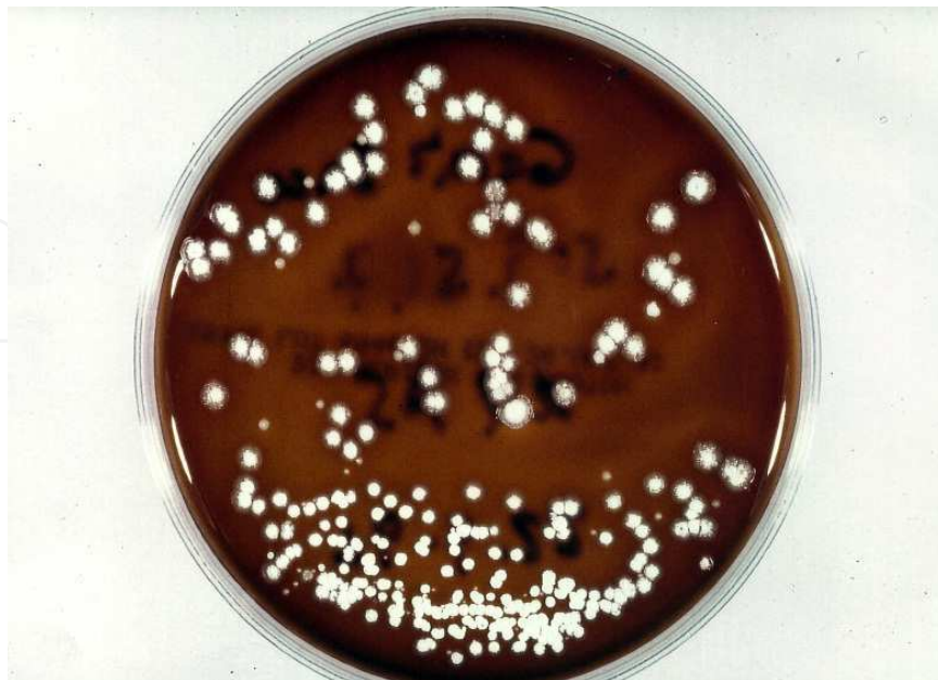
Fig. 3. Colonies of Nocardia.