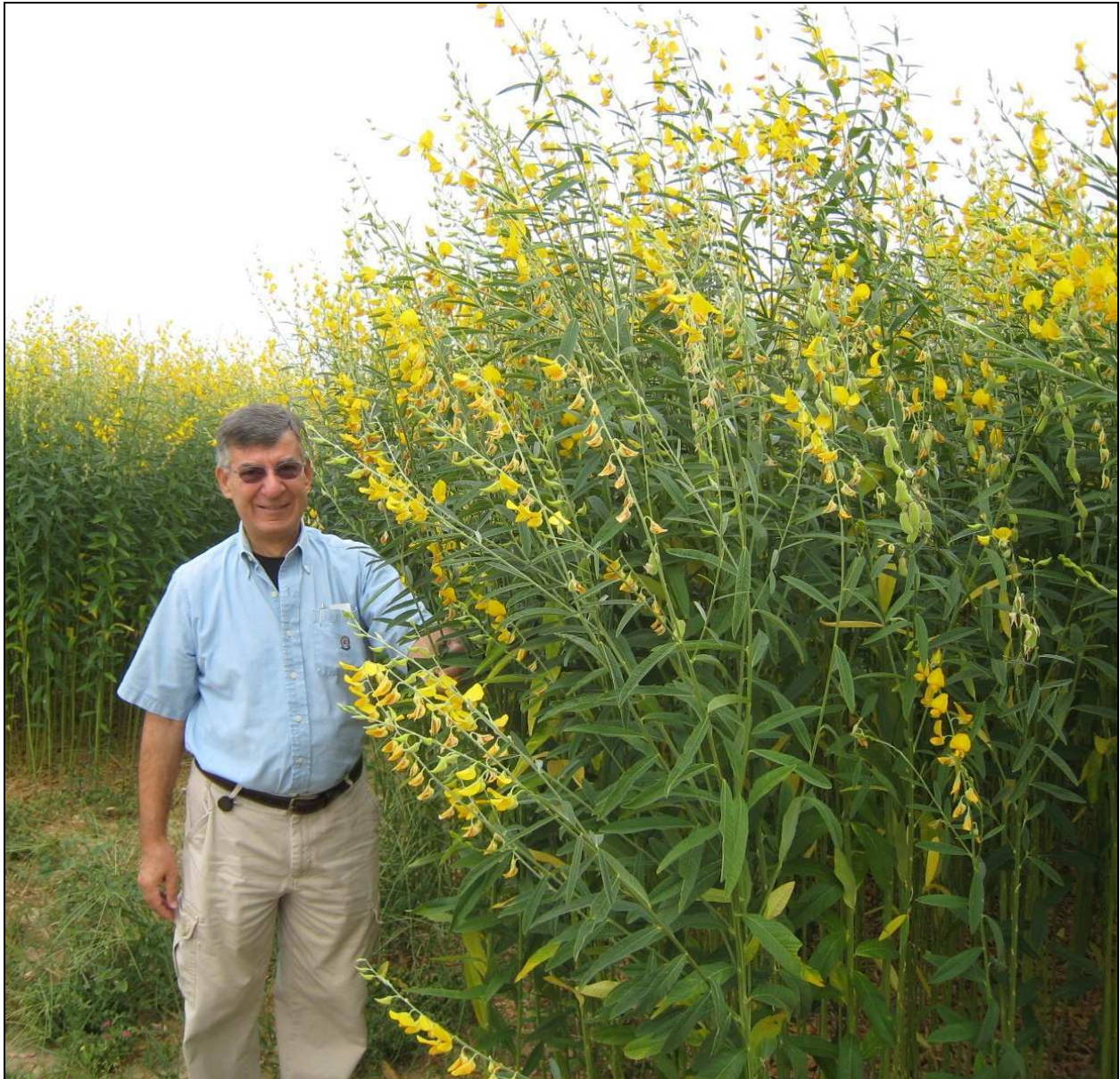
Fig. 2. The vigorous growth of sunn hemp cultivars developed at Auburn University, Alabama, can be seen here, 70 days after planting.