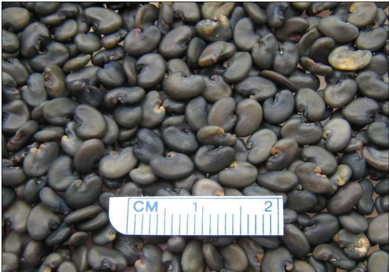
Fig. 3. Sunn hemp seed production can yield 450 to 1000 kg of seed per hectare.

production typically requires a longer season than can be achieved before winter conditions in temperate regions (Li et al. 2009)(sunn hemp seed pictured in Figure 3). The lack of seed production outside of tropical and subtropical climates severely limits seed availability to producers in cooler climates. Moreover, with seed costs ranging from $90 to $130 (US) per hectare, implementation of C. juncea as a cover crop can be an expensive task for growers (Li et al. 2009; Petcher 2009).