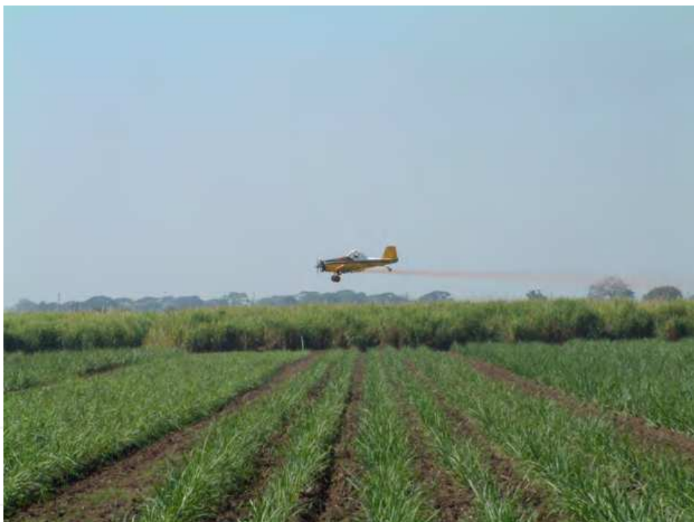
Fig. 3. Aerial application of ripener using an agricultural aircraft.

The physiology of sugarcane ripening has been studied for more than 30 years. Natural ripening in early harvest may be poor, even in early varieties. In this context, the use of chemical ripeners stands out as an important tool (Dalley & Richard Junior, 2010). Due to the areas cultivated with sugar cane are extensive, the application of these products is normally done with agricultural aircraft (Fig. 3), but helicopters can also be used for this purpose (Fig. 4).