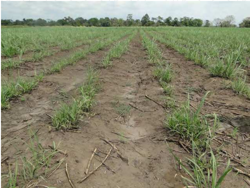
Fig. 6. Detrimental effect on sprouting ratoons after harvest from glyphosate treated areas.

harvest from treated areas, with a reduction of tillers per meter (Fig. 6), which would lead to lower productivity in the next harvest (Leite & Crusciol, 2008). For this reason, glyphosate has been widely used in areas that will be used for the implementation of a new cane field. However, there are also reports that glyphosate did not cause any detrimental effects on sugarcane quality and productivity (Viana et al., 2008). Due to the strong influences that factors such as dose, variety and climatic conditions have on the effectiveness of the product, this issue merits further study.