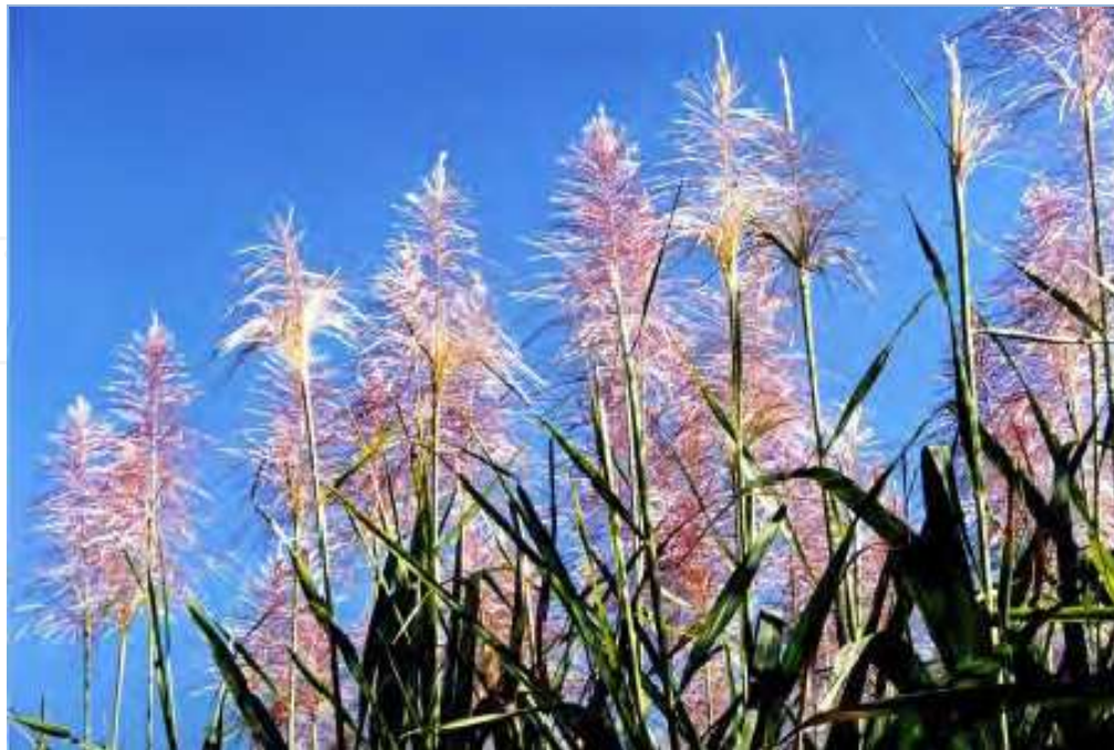
Fig. 1. Flowering of sugarcane.

Another aspect refers to the phenomenon of the pith process (Fig. 2) related to the flowering and ripening of sugarcane, which occurs in some varieties and is characterized by the drying of the interior of the stalk from the top. The pith process leads to a loss of moisture in the tissue, with a consequent reduction of the juice stock and an increase in the fiber content of the stalk. Thus, although the concentration of sucrose in the stalk is increased, it is difficult to extract and involves the loss of stalk weight and, consequently, a reduction in the final yield.