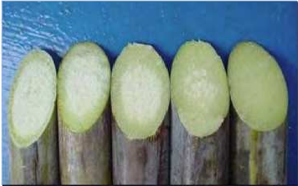
Fig. 2. Different grades of pith process in sugarcane. From the left to the right, intense pith to no pith.

Quantification of the degree of the pith process and the possible changes in the quality of the raw material may provide critical data to the design of the area to be planted for each variety and the best time periods for industrial use. The intensity of the flowering process and its consequences for the quality of raw materials vary with the variety and climate. Therefore, reducing the amount of juice is the main factor that is affected by flowering.