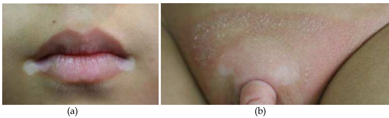
Fig. 3. A. Vitiligo on angles of mouth. B. Vitiligo associated with atopic dermatitis and diaper dermatitis.

Enough rest and appropriate treatment can help vitiligo in the “T-zone” areas where seborrheic dermatitis commonly occurs. If a lesion appears in areas which have a predilection for atopic dermatitis, doctors should pay special attention to treatment of the skin lesion. Adjunctive use of ketotifen and gamma-linolenic acid is useful. For the patient in Figure 3B, phototherapy as well as treatment for atopic dermatitis and diaper dermatitis would be necessary.