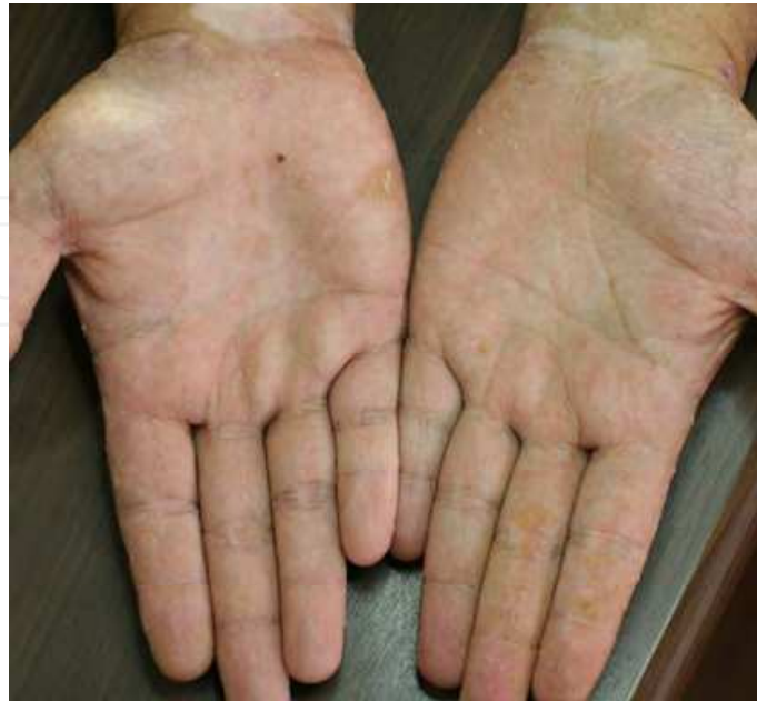
Fig. 4. Arsenic keratoses in vitiligo patient

applying them to the skin can improve vitiligo. Nevertheless, it is more beneficial not to use these in terms of potential risks involved.