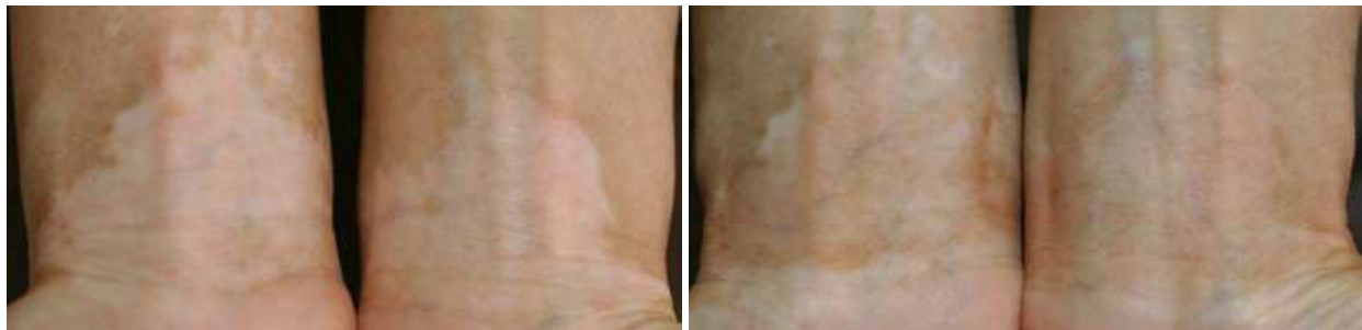
Fig. 5. Concealing with 7.5% dihydroxyacetone (left), and walnut shell extract (right). A. Before concealing. B. After concealing.

Applying a dye from premature walnut shells is a natural pigmentation aid for vitiligo. Premature walnut shells are frozen and made into a solution. This can further be diluted to match skin color, in particular for patients with yellow undertones. However, this method can cause an allergic contact dermatitis (due to the walnut shell), and due to the instability of the dye solution, it becomes less effective after a day.