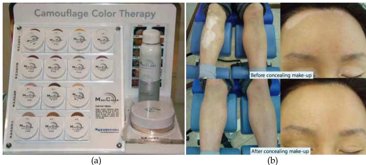
Fig. 6. (a). Concealer cosmetic set for vitiligo patients. (b). Patient before and after makeup. Courtesy of Dong-Sung Pharmaceutical, Co., Seoul, Korea.

Special makeup products are also helpful. Cosmetics are limited by their easy removability (can be washed away by sweat) and they can be messy (get on clothing), however tend to give vitiligo lesions the most natural skin color. Many patients prefer makeup, which can achieve cosmetically acceptable results in an investment of 20 minutes a day. Special makeup is acceptable, but it is more effective when combined with DHA or walnut solution. Figure 6 shows a patient before and after makeup. To maintain the stability of makeup where it is applied, non-glossy hair spray (Korean) or Cavilon 3M™ spray (Tanioka & Miyachi, 2008) can be used after application of makeup. Some KAV patients use spray-on stockings on a DHA-primed leg lesion and results are often satisfactory. However, it is difficult for beginners to produce satisfactory results using various makeup products. The methods using DHA, walnut shell, and special makeup products all require hours of patient teaching and practice. Tanioka and Miyachi (2009) also emphasized the importance of lessons in camouflage techniques.