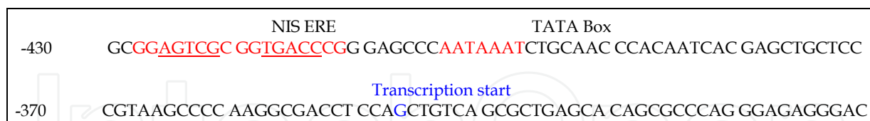
Fig. 1. Functional NIS ERE sequence is located in close proximity of NIS TATA box element in the promoter region. Human NIS gene proximal promoter region sequence is partly shown. Numbers indicate positions of nucleotides relative to NIS start (ATG) codon. The transcription start site is indicated in blue letter (G), TATA box element, and novel ERE sequences are indicated in red, and in writing above these sequences. Two inverted repeats (half sites) of the NIS ERE element located in minus strand are underlined in red.

compared to males, or possible explanations related with molecular mechanisms leading to I- transport deficiencies (ITD) in females, seen with a higher prevalence during or after pregnancy (Patrick, 2008).