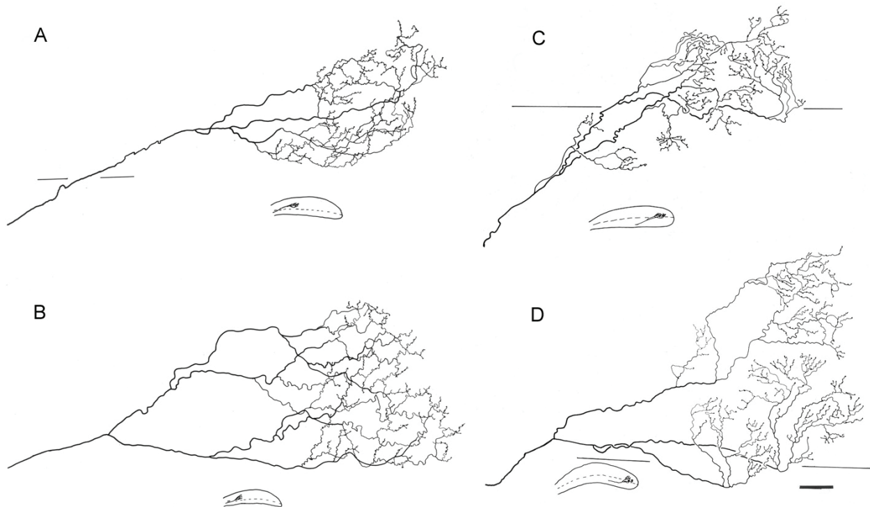
Fig. 2. Camera lucida drawing of the axonal arbor in the mid rostral (Fig. 2A) tectal region of a normal rat, total area of the terminal was 11250 \mu\text{m}^2 . In the glaucomatous animal, the area of terminal axonal arbor at similar location to the normal was 12480 \mu\text{m}^2 (Fig. 2B). In the caudal tectum of normal rat, the area of the normal optic axonal terminal was 14290 \mu\text{m}^2 (Fig. 2C) whereas it was 18060 \mu\text{m}^2 in glaucomatous side (Fig. 2D). It was also noted that these were less vericosities and relatively less dense boutons when compared to the normal

Anatomical evidences for observed enlargement of receptive fields in experimental glaucoma point to the increase in the axonal terminal arbors of the remaining retinal ganglion cells axons in the contralateral superior colliculus. Figure 2 shows the morphology of RGC axonal terminal in the superior colliculus. The axons at proximal and distal portion of superior colliculus (Figure 2A and 2C) in the normal IOP animal are displayed. With elevation of IOP for 4 months, the axons at the same level were enlarged and more terminal branches were identified (Figure 2B and 2D). This suggests that surviving axons may occupy the territory of the dead axons.