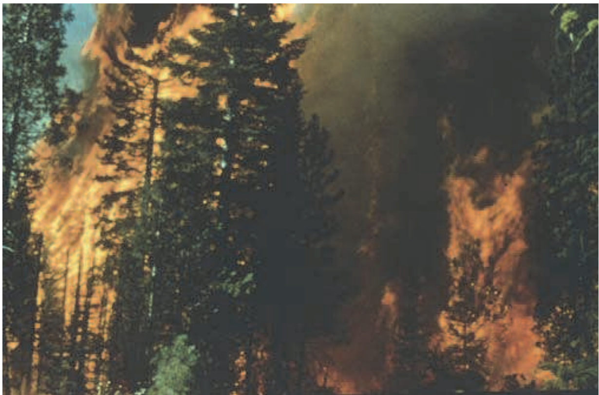
Fig. 1. High severity, stand replacing wildfire, Apache Sitgreaves National Forest, Arizona. (Photo courtesy of the U.S. Forest Service).