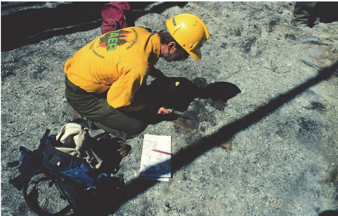
Fig. 2. White and gray ash typical of high severity fire remaining after a spruce-fir stand that was burned at high temperatures for a long duration, Coon Creek Fire of 2000, Tonto National Forest, Arizona. (Photo by Daniel G. Neary).

The heat radiated downward during the combustion of aboveground fuels is transferred either to the surface of the forest floor, or directly to the surface of mineral soil if organic surface layers are absent. In most forest ecosystems, heat is usually transferred to an organic layer of litter and duff. When duff is ignited it can produce additional heat that is subsequently transferred to the underlying mineral soil. The depth that heat penetrates a moist soil depends on the water content of the soil, and on the magnitude and duration of the surface heating during the combustion of aboveground fuels, litter, and duff (Frandsen 1987). During long-duration heating, such as that occurring under a smoldering duff fire or when burning slash piles, substantial heating can occur 40 to 50 cm downward in the soil. (Figure 2). This prolonged heating produces temperatures that are lethal to soil organisms and plant roots, and create water repellency that greatly diminishes hydraulic conductivity.