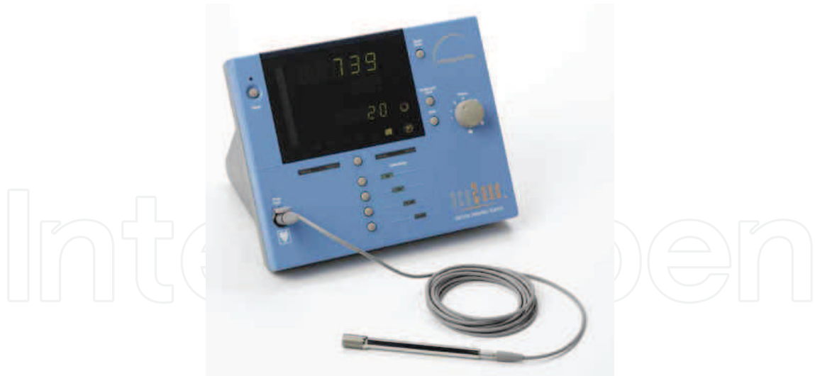
Fig. 2. Gamma probe used to locate sentinel lymph node

Significant controversy surrounds the use of sentinel lymph node biopsy in thin, early melanomas. There are a number of reasons for this. Firstly, patients with a low-risk of nodal metastases are exposed to the toxicity of a potentially unnecessary procedure. Secondly, the routine use of sentinel lymph node biopsy is expensive: global application of sentinel lymph node biopsy in all patients is estimated to cost between $700,000 and $1,000,000 for every sentinel node metastasis detected (Agnese et al., 2003).