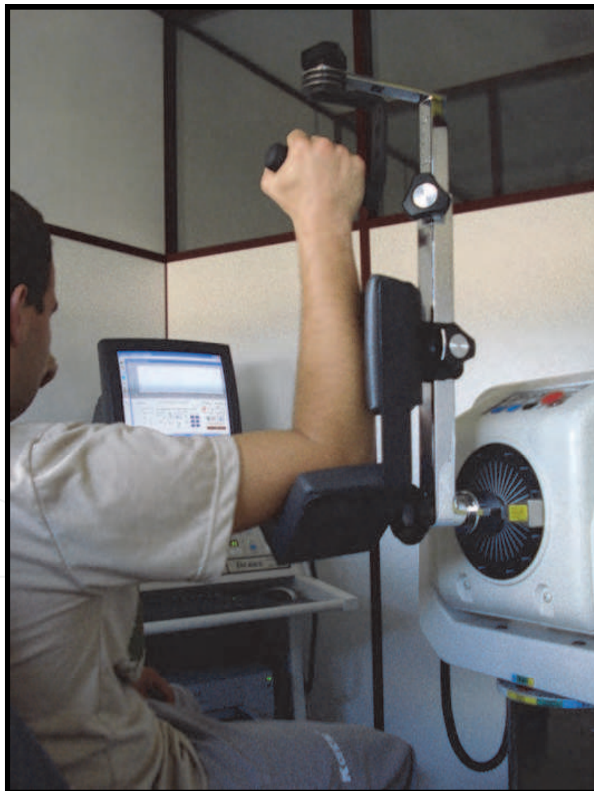
Fig. 2. The isokinetic dynamometer is used for assess joint position sense and sense of limb movement

Sense of limb movement is evaluated by measuring the threshold to detection of passive motion (Allegrucci, Whitney, Lephart, Irrgang, & Fu, 1995; Carpenter, et al., 1998; Lephart, Giraldo, Borsa, & Fu, 1996; Li, Xu, & Hong, 2008; Skinner, et al., 1986; Torres, et al., 2010). Threshold to detection of passive motion quantifies a subject ability to consciously detect movement, as well as, its direction and is often performed on some type of proprioception testing device such as an isokinetic dynamometer (Figure 2).