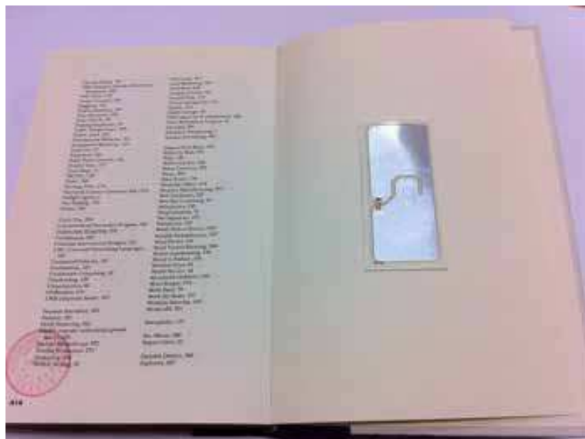
Photo 1. In the pilot test conducted by the CityU HK Library, UHF RFID tags were randomly placed in four different positions at the back covers of the books. The photo shows one of the selected positions.

For the case of the CityU HK Library, the UHF RFID tags that the Project Team has used in its pilot test were of an optimal size with a dimension of 72mm x 30mm. The Semi-Closed Collection where the pilot test was conducted is a very small room of about 75sq.m. only. The self-check machines, the self-return machines and the security detection gates are all in proximity. For instance, the security detection gates are only 4.5 meters away from the nearest bookshelves. Therefore, the Project Team must be even more cautious when choosing the tags. Different tests have been performed to ensure that the size of the buffer zone required around the detection gates is kept to a minimum and at the same time the self-check machines can read the most number of tags when books are placed on top of them so as to maximize the benefit of multiple item identification at the check-out process. In the Semi-Closed Collection, the UHF RFID tags have been placed at the back covers of books with a book plate of 150mm x 100mm on top to act as a camouflage to hide the tags from the scene (Photos 1 and 2). To reduce the tag masking probability, during the tagging process, tags have been randomly placed in four different positions behind the book plates. However, the additional book plates mean additional costs and labour.