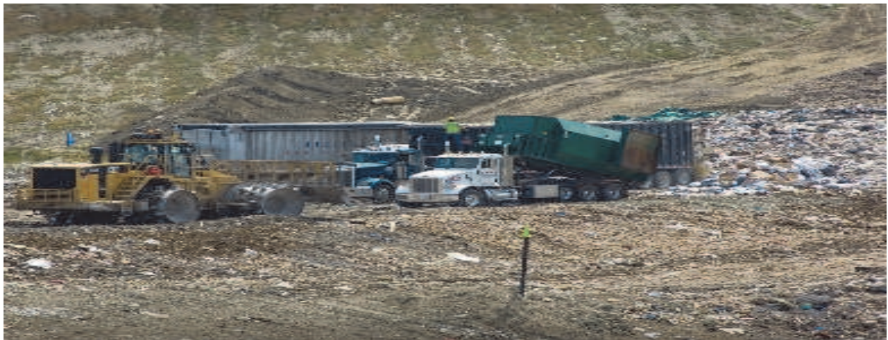
Fig. 1. Turnkey Recycling and Environmental Enterprises, Rochester, New Hampshire.