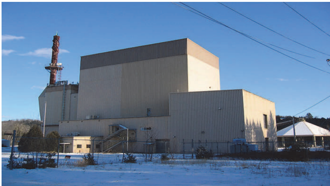
Fig. 4. Indeck Energy Services, Inc., Alexandria, NH.