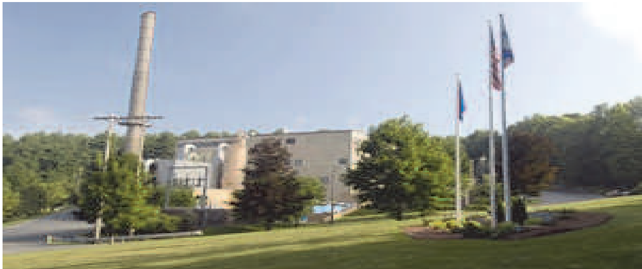
Fig. 6. Wheelabrator Technologies, Inc., Claremont, NH.