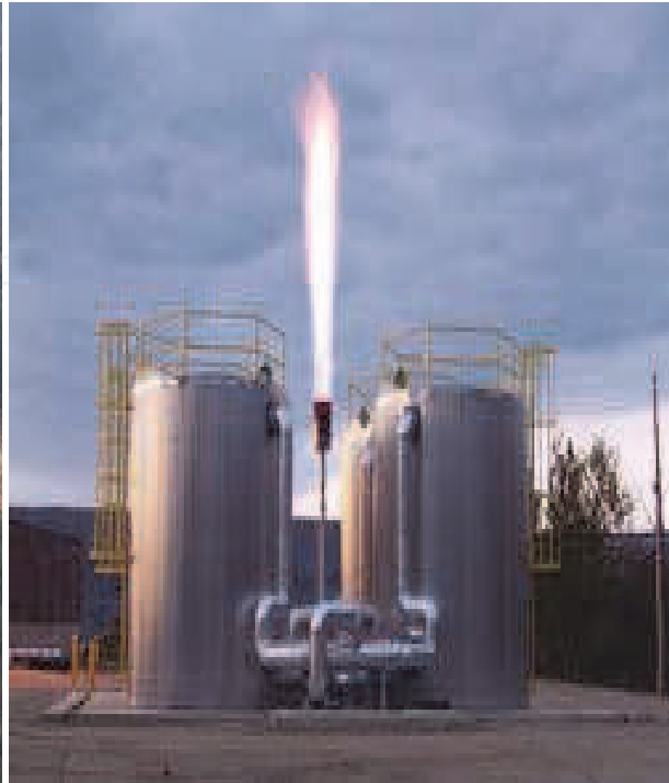
Fig. 2A. Mt. Carberry Landfill, Berlin, NH.