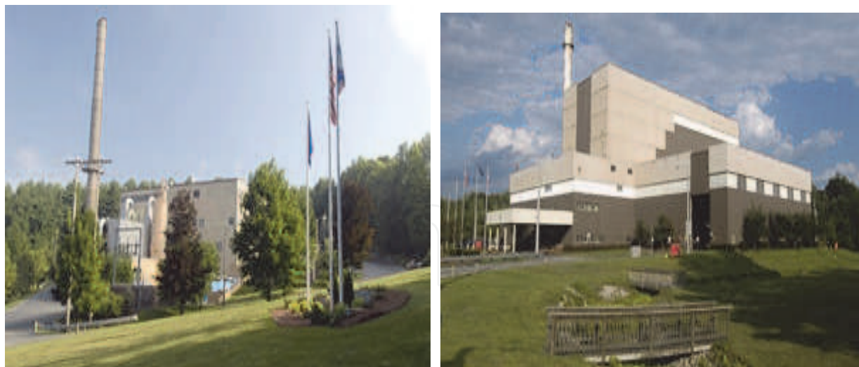
Fig. 7. A and B. Wheelabrator Technologies, Inc. in Claremont and Concord, NH, respectively.