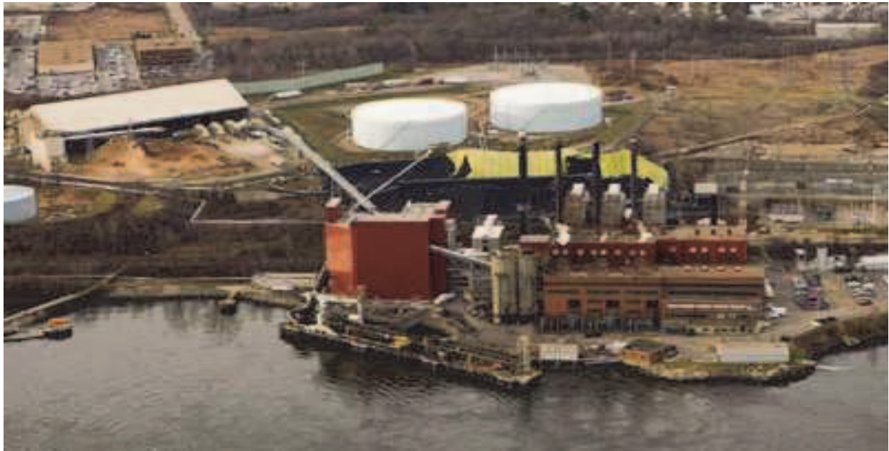
Fig. 5. Schiller Station, Portsmouth, NH.