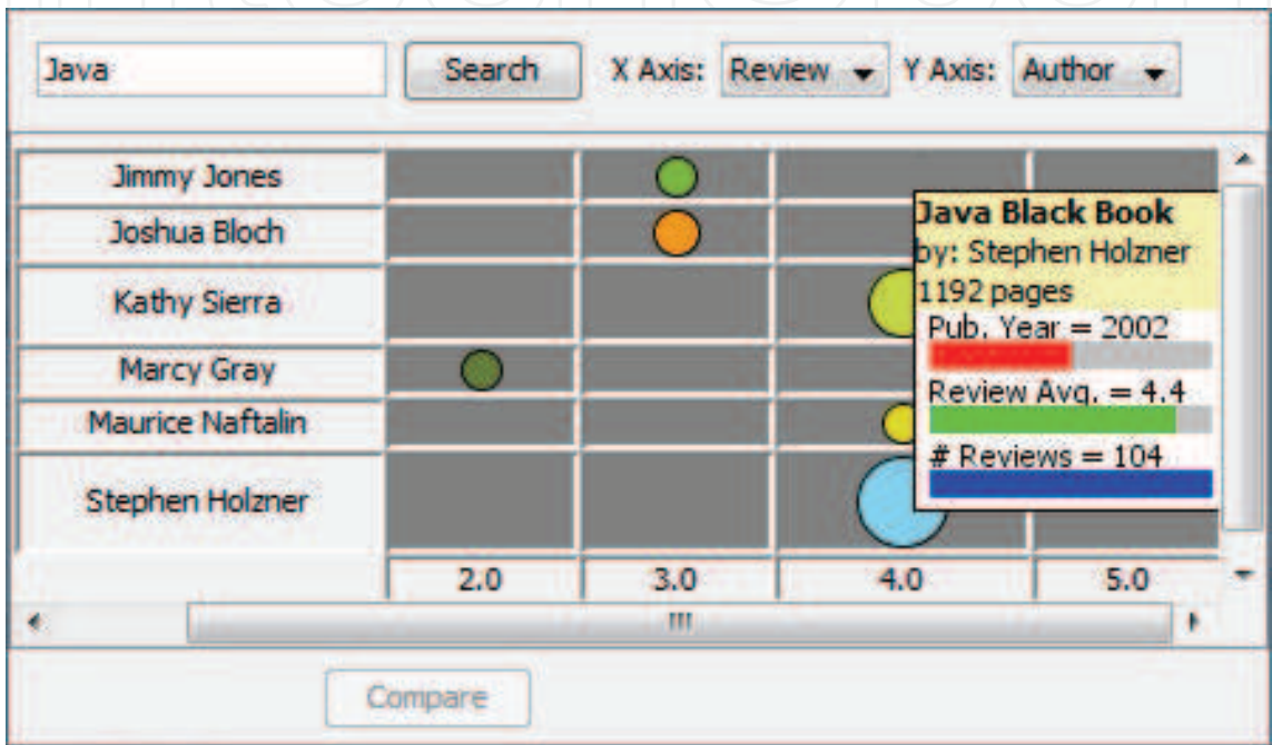
Fig. 1. Overview interface displaying search results with tool-tip

spread-sheet style organization of book search results. The attribute of each axis can be independently selected by the user, allowing for a more targeted display and increasing the users’ comprehension of the data set (Shneiderman et al., 2000). This functionality will assist the user in customizing the search based on their own judgment of which attributes are more important. In the Overview, each book is represented as a circular node, located in the appropriate cell based on the axes. To deliver the estimated amount of content, node size is determined by the normalized page count of the book compared to the rest. Books with a greater number of pages naturally map to the largest nodes. This will allow users to quickly identify the amount and distribution of content available.