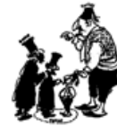
Figure 1. Placid mothers or 'Mine is bigger than yours'. William Elias Pappas, 15 February 1964.

Fig. 2. Landow upholds the traditional scholarly article (example on right) as the perfect embodiment of hypertext.