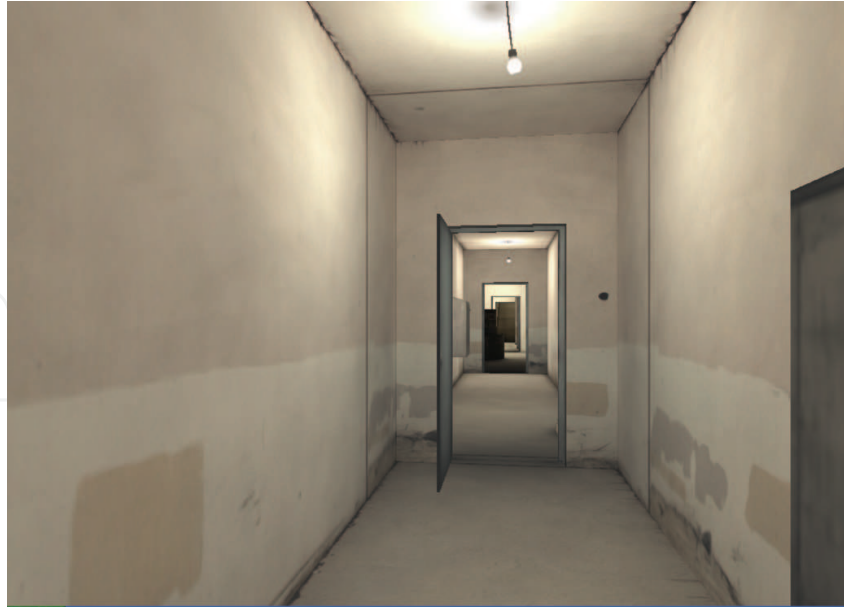
Fig. 4. Image of one of the rooms of the virtual maze that was used in the studies that analyzed presence in virtual environments using TCD

variations were observed in the free navigation condition than in the automatic navigation condition. As in the previous study, the observed differences in MCA-L can have their origin in the motor tasks differences between navigation conditions. On the other hand, a possible explanation of the differences in MCA-R percentage variations between navigation conditions could be found in the higher degree of involvement of the user in the creation of a motor plan in the free navigation condition. Results from questionnaires also found higher values of presence during the free navigation condition.