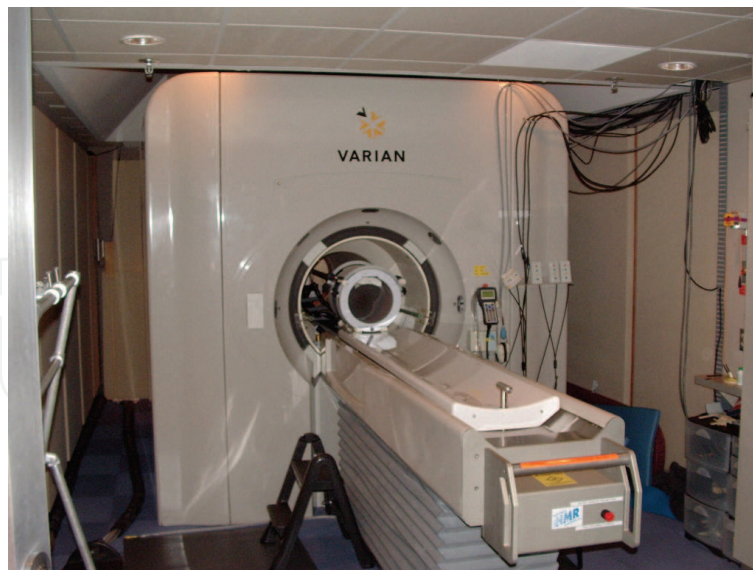
Fig. 3. 4T fMRI, part of the Brain Imaging Center, in: Helen Wills Neuroscience Institute at the University of California, Berkeley

fMRI is used for the study of metabolic and vascular changes that accompany changes in neural activity. The technique is based on the Blood Oxygen Level Dependent method (BOLD), which measures the ratio of oxygenated to deoxygenated haemoglobin in the blood across regions of the brain. As oxygen is extracted from the blood, increases in deoxyhaemoglobin can lead to an initial decrease in BOLD signal. However, this is followed by an increase, due to overcompensation in blood flow that tips the balance towards oxygenated haemoglobin. It is this that leads to a higher BOLD signal during neural activity. fMRI is not a tool that can be easily combined with virtual reality environments. First of all, a test platform has to be developed to allow the exposition to the virtual environment while capturing the fMRI images without altering in a significant way any of both technologies. Moreover, the user has to be inside the magnetic resonance machine in supine position and with minimum head movement, and devices used to navigate and interact in the virtual environment have to work inside high magnetic fields with minimum electromagnetic interference.