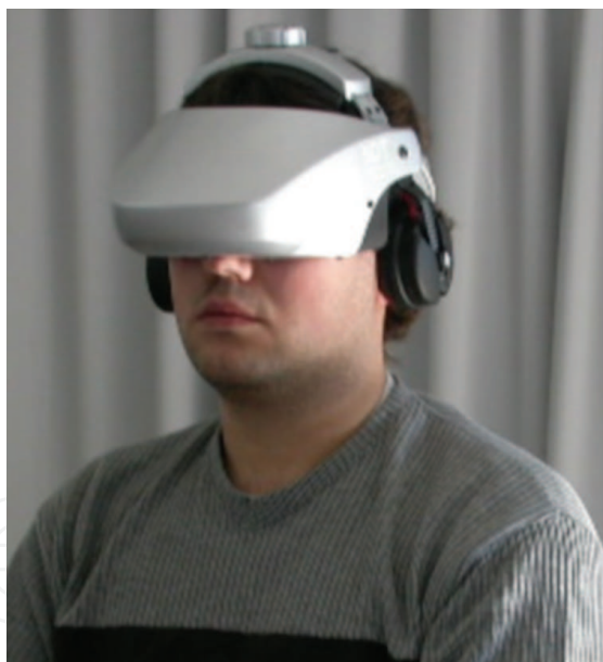
Fig. 1. Subject of a virtual reality experiment wearing a head mounted display

Tarr & Warren (2002) considered that three sources of information were available for this learning process: visual information in the form of optic flow (the pattern of visual motion at the moving), visual information about objects distributed in the environment (which can be used as landmarks) and body senses including vestibular and proprioceptive information. In order to analyze the influence of each of those factors, it is necessary that the subject moves through an environment where the experimenter can manipulate aspects such as the optic flow and the objects that appear in the environment. Virtual reality can be used to generate this controlled environment where the participant can navigate freely.