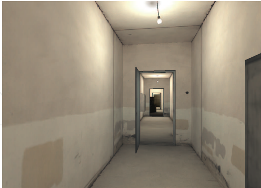
Fig. 4. Image of one of the rooms of the virtual maze that was used in the studies that analyzed presence in virtual environments using TCD

variations were observed in the free navigation condition than in the automatic navigation condition. As in the previous study, the observed differences in MCA-L can have their origin in the motor tasks differences between navigation conditions. On the other hand, a possible explanation of the differences in MCA-R percentage variations between navigation conditions could be found in the higher degree of involvement of the user in the creation of a motor plan in the free navigation condition. Results from questionnaires also found higher values of presence during the free navigation condition.