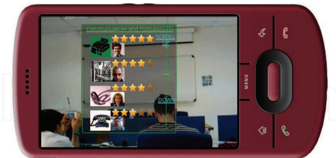
Fig. 4. An example of an Augmented Reality interface for a mobile location-based pervasive content sharing application