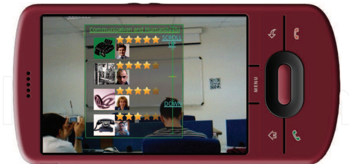
Fig. 4. An example of an Augmented Reality interface for a mobile location-based pervasive content sharing application