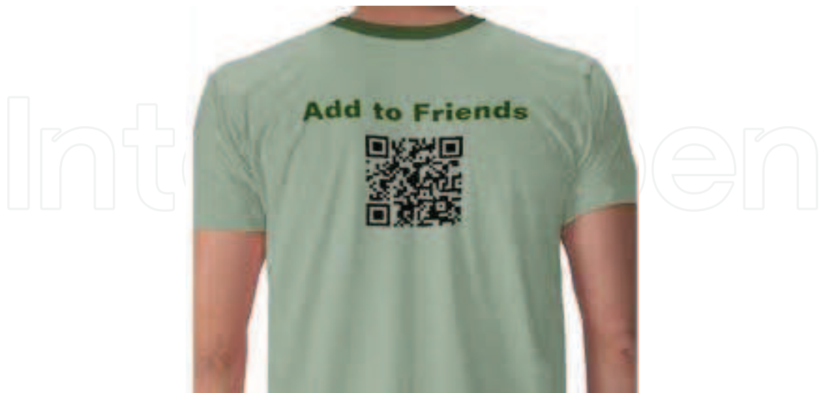
Fig. 3. QR code for labelling not only the world, but also people.

including customer reviews and also enables to write a personal review. The application does not adopt an AR interaction modality.