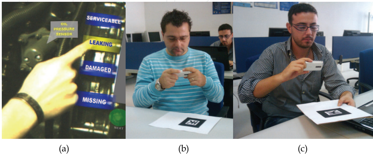
Fig. 2. Three Augmented Reality interaction approaches

A new research direction concerns the combination of AR with the physical manipulation of Tangible User Interfaces. In Fig. 2 (a) the user touches a virtual button to select a menu option. The camera tracks hand gestures and the device camera preview is augmented with overlaid 3D objects to provide visual feedbacks.